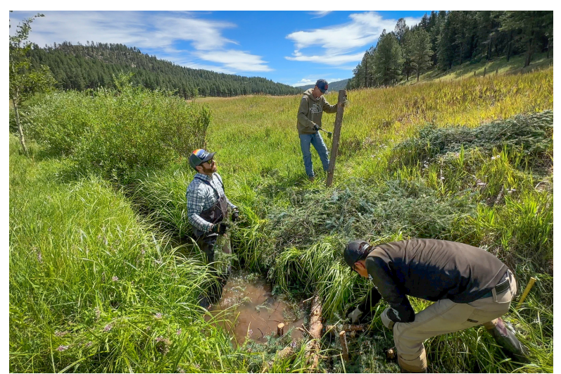
2-3-2 Partners participate in a stream restoration project.