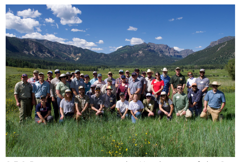
2-3-2 Partners on a tour at the Headwaters of the San Juan River and the San Juan-Chama Project.

Supported defensible space work for low-income housing through CAFA programming.