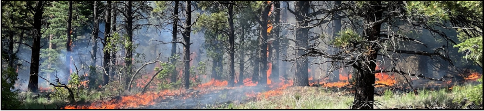
Dorado/Cañada del Agua prescribed fire on the Carson National Forest.